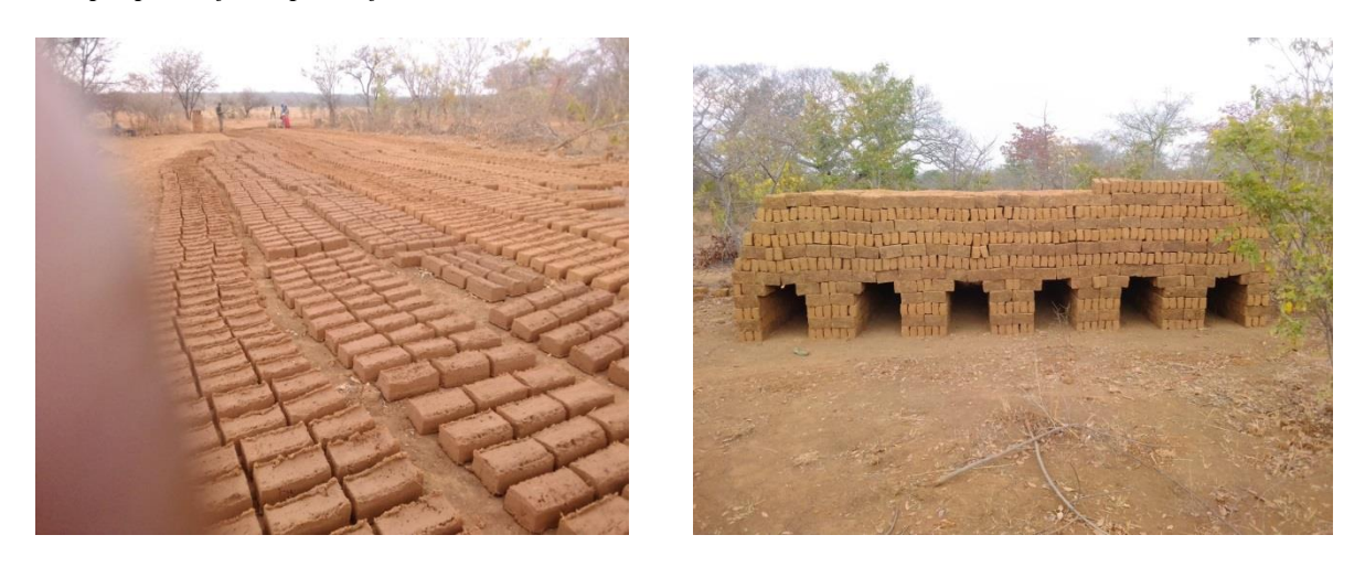
Bricks being moulded. The target is to get 20 000 bricks for the teacher's house.