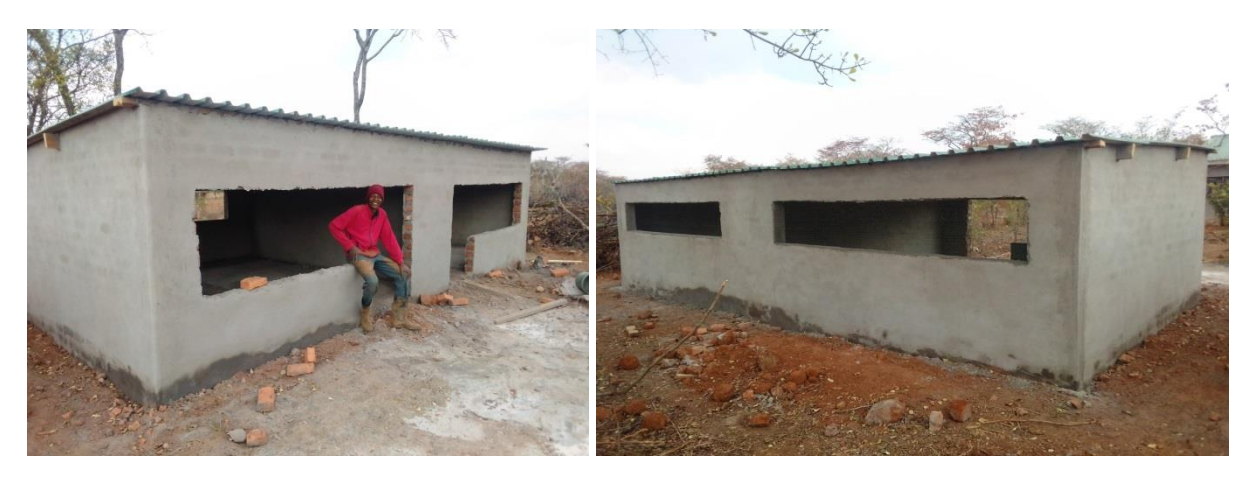
The completed fowl run with two compartments. It can house over 300 broilers at a time.