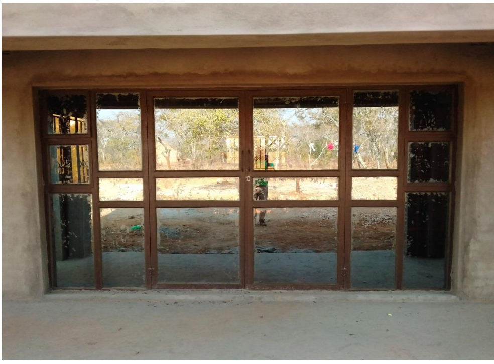
Glasses to the front door of the hostel were fixed successfully in the month.