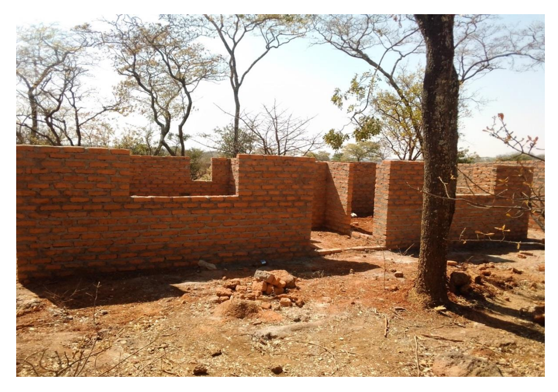
The two rooms were left at this stage. Building material ran out. These will be completed in future when resources permit.